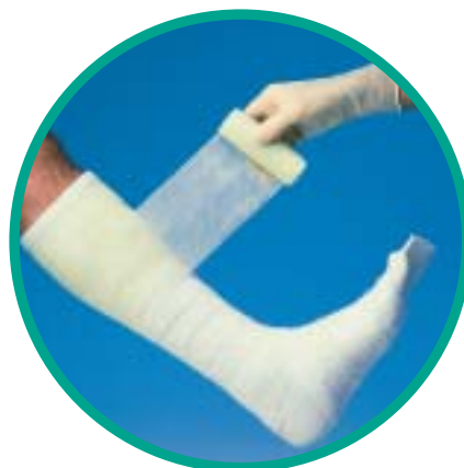
Quick and easy to apply